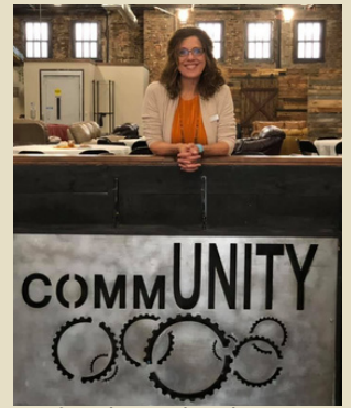
My first day on the job in 2019!